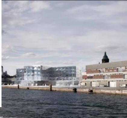
New hotel (Herzog & Meuron)