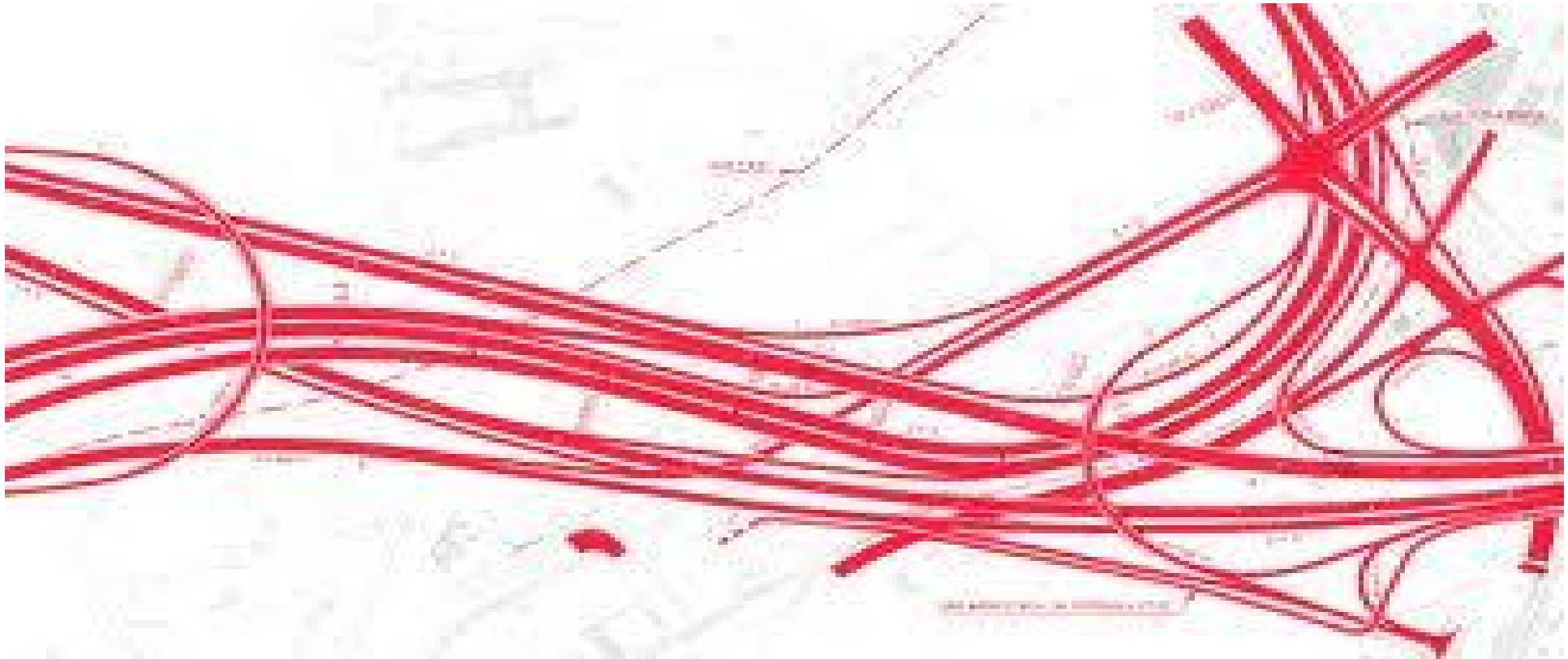
Motorway system through the city of Helsinki, plan 1968, Smith & Polvinen